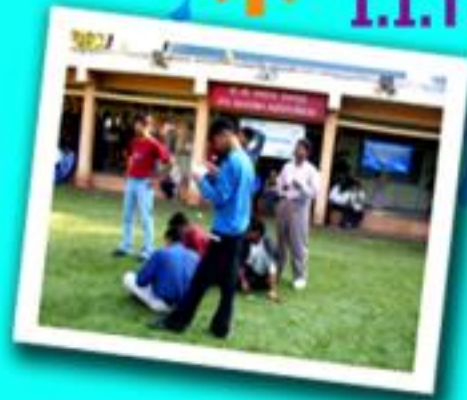
* I.I.T. Bombay