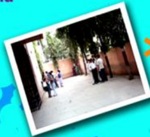
* C.H.M. College