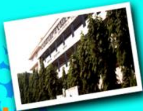
* Jhunjhunwala College